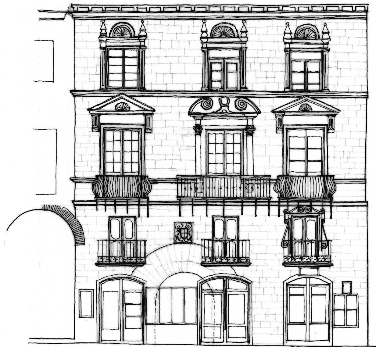
ALZADO E: 1/100